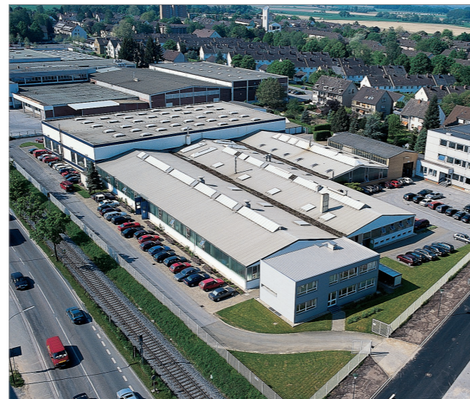
Company headquarters in Lippstadt.

"After all PLM is not a project that comes to an end, but instead is part of the continuous development of the company."